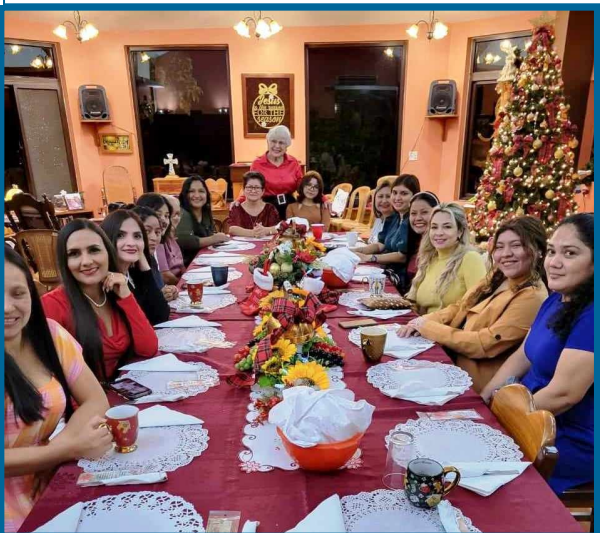
Ladies Bible Study Christmas Party